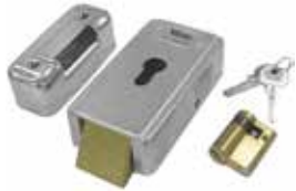
LOCK HO Horizontal electro lock 12 V