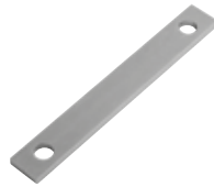
INTRO FR Adapter for foundation boxes