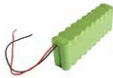
BAT M 016 24 V 1.6 Ah battery