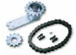
INT 360 Kit for 360° leaf opening