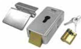
LOCK VE Vertical electro lock 12 V