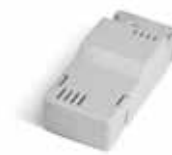
BAT K3 Battery charge card for BAT M 016