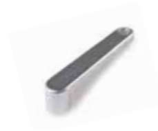
INK Lever-type unlock for INTRO LOCK (4 pcs/pack)