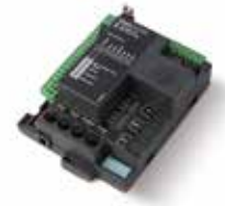
STARG8 24 24 Vdc spare control unit