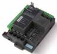
STARG8 AC 230 Vac spare control unit